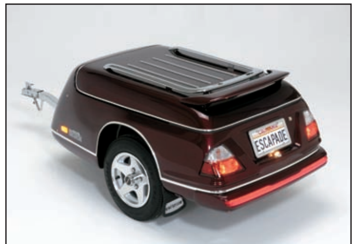
(Shown with optional spoiler, luggage rack, lightbar, mud flaps & aluminum wheels.)

Never before has a trailer been so deserving of its name than Escapade's Elite trailer. Designed specifically with the GL1800 Goldwing in mind, the result is a trailer that beautifully incorporates the sleek lines and style characteristics of the Goldwing while maintaining the unsurpassed quality and engineering for which Escapade is renowned. You'll be amazed at the value you'll receive with this trailer. All of the great features of its predecessors—the SE and LE—have been incorporated into the Elite. These standard features and optional accessories serve to make the Elite the finest example of craftsmanship and style on the road, including a 10 year warranty on the trailer frame.