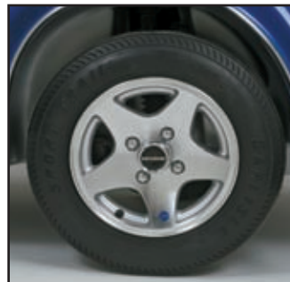
Optional Aluminum 5-Spoke Wheel