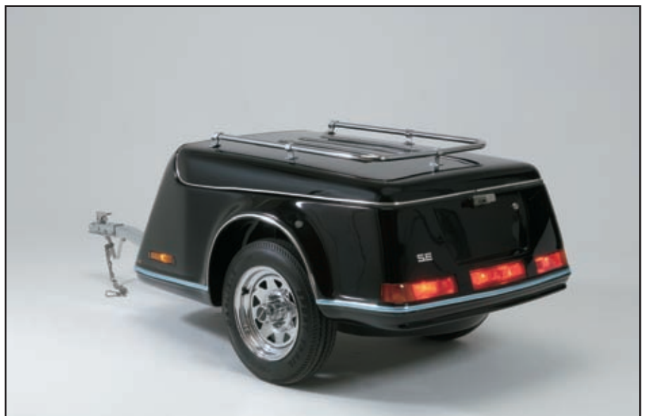
(Shown with optional chrome tongue, chrome wheels & luggage rack)

While other manufacturer's offer a similar product, none compare to Escapade in quality, value or price. We've spent more than 30 years establishing our reputation as the premier manufacturer of motorcycle touring accessories, so you know you're getting the best value for your money.