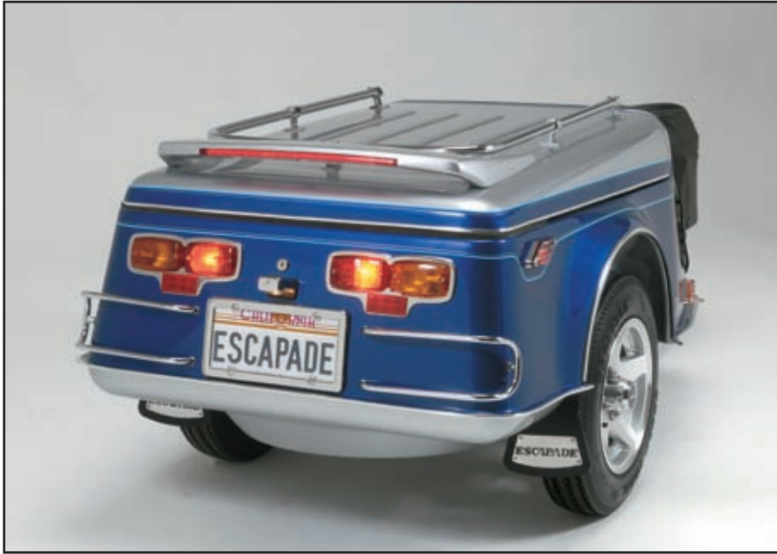
(Shown with optional spoiler, luggage rack, bumpers, mud flaps & aluminum wheels.)