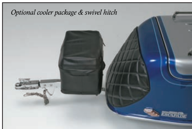
Optional cooler package & swivel hitch