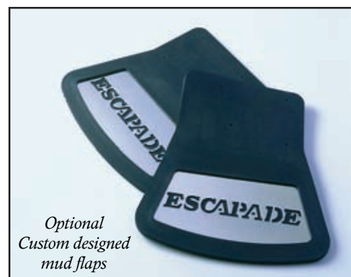
Optional Custom designed mud flaps

We hope you will enjoy pulling these trailers as much as we have enjoyed making them!