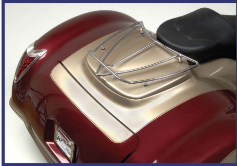
Optional Luggage Rack

Introducing California SideCar's first trike for the Kawasaki brand of motorcycles. This unique trike body compliments the styling features of the motorcycle from the fuel tank lines to the tear-drop style tail lights of the Voyager and Nomad models.