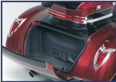
8.1 cu. ft. Storage Capacity