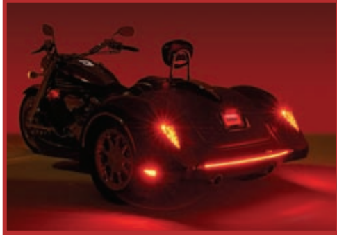
Night View with LED Tail Lights and Light Bar

Introducing the industry's first trike kit for the Yamaha Roadliner/Stratoliner models. Designed to match the motorcycle, the trike body incorporates the chrome accents from the fuel tank and keeps the spoke wheel look and teardrop style LED tail lights of the motorcycle. It is classic CSC styling all rolled into a retro style hotrod look for the Roadliner/Stratoliner series from Yamaha motorcycles.