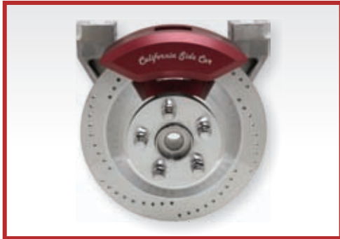
Optional Performance Brake